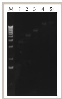
Figure 1. An AmpliScribe™ T7 High Yield Transcription reaction produces full-length, long RNA transcripts. Aliquots from standard 20 µl AmpliScribe T7 High Yield Transcription reactions were loaded onto a 1% agarose-formaldehyde gel and stained with ethidium bromide. The size of the RNA transcripts and RNA yields (in parentheses) were: Lane 1, 2.8 Kb (155 µg); Lane 2, 3.8 Kb (160 µg); Lane 3, 4.8 Kb (154 µg); Lane 4, 7.3 Kb (156 µg); Lane 5, 8.0 Kb (156 µg).

Five linearized DNA templates, producing RNA transcripts of 2.8 Kb, 3.8 Kb, 4.8 Kb, 7.3 Kb, and 8.0 Kb, were individually transcribed in standard 20 µl AmpliScribe T7 High Yield Transcription